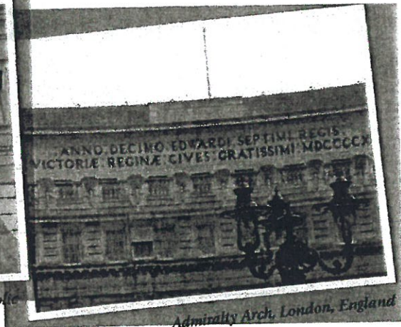
Admiralty Arch, London, England